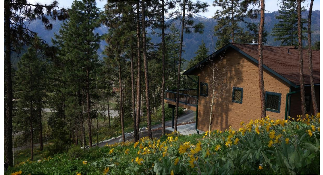
Before and After Suncrest Fire 2016