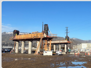
Completed piers and columns at the Miller St overpass