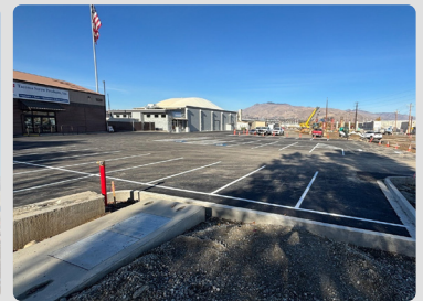
Demolition and restoration complete near the North Miller Business Park, making way for the Miller St overpass