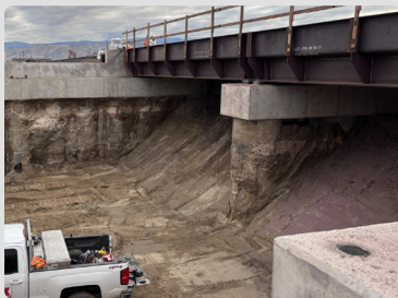
Excavation occurring at the McKittrick St Bridge