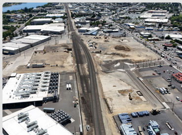
Temporary track built by BNSF to allow McKittrick Street underpass construction